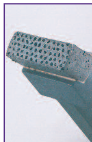
7/16 x 1-5/8" Impregnated Tip PDGX-11C, M or F or PDGS-11C