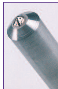
7/16 x 2" OAL Single Point 6VS-72 Most Versatile One Carat