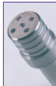
7/16 x 1-5/8" OAL Multi-Point Cluster CL5 Most Economical 1-1/4 Total Carats